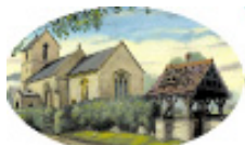
Ashton Village Group