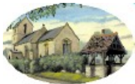
Ashton Village Group