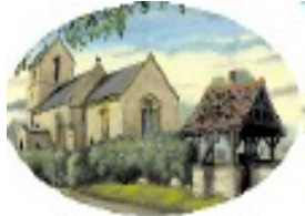
Ashton Village Group