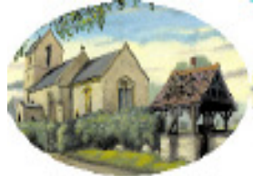
Ashton Village Group