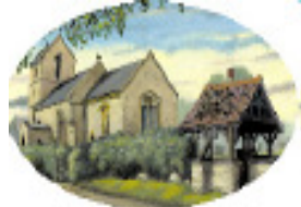
Ashton Village Group